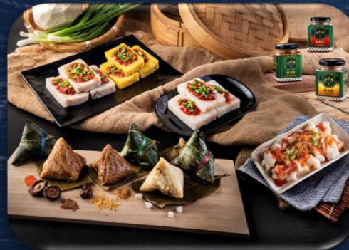
FOOD AND BEVERAGES