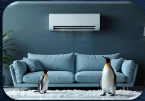
AIRCON AND ENGINEERING