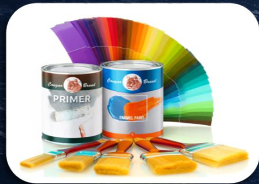
PAINT AND COATINGS